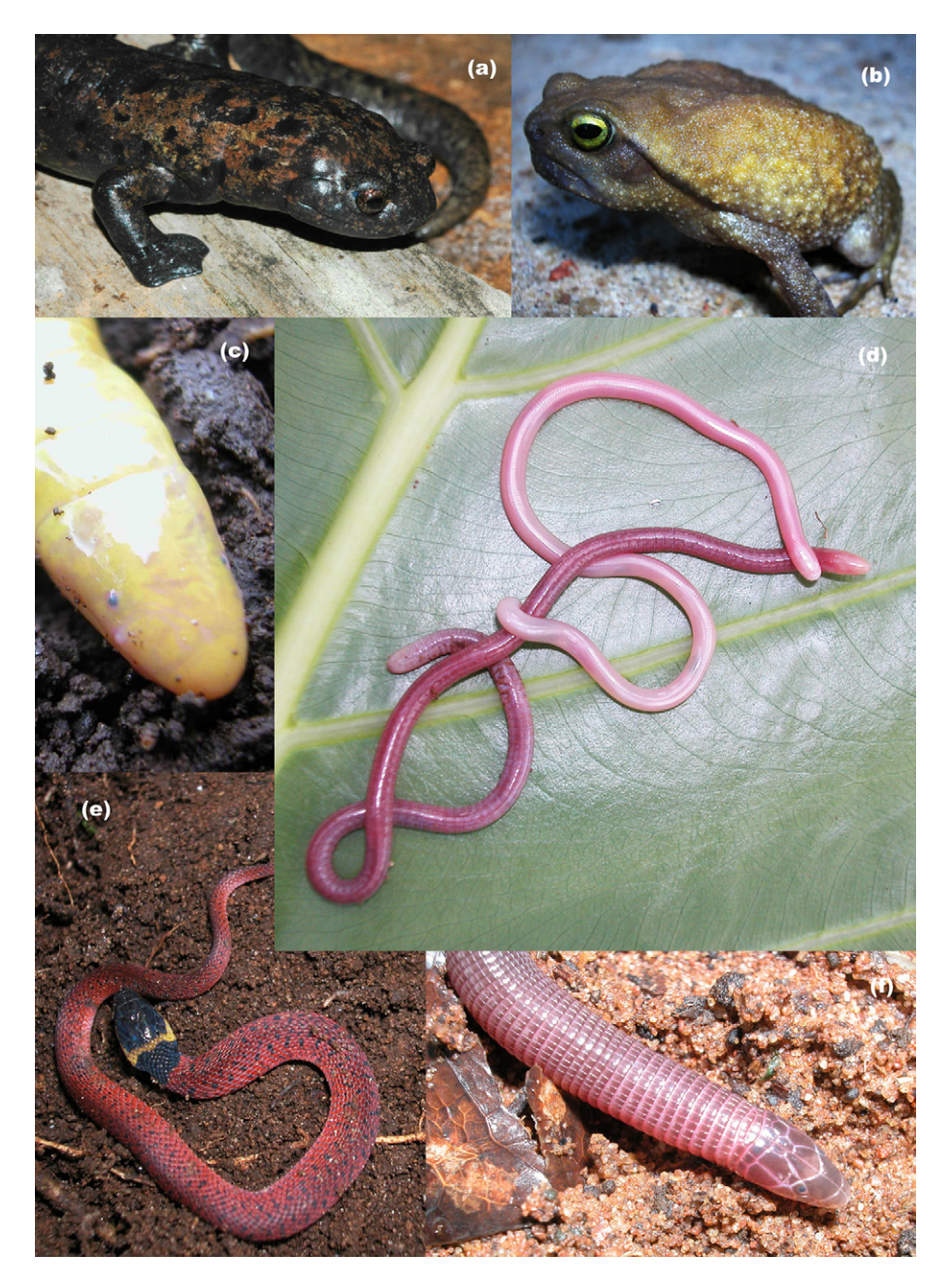
Fig. 1. Examples of the biodiversity of soil herpetofauna. Many diverse herpetofaunal taxa live in the soil, and while some resemble well known groups (e.g. (a) the salamander Bolitoglossa dofleini and (b) the rain frog Probreviceps maculatus ), other more dedicated subterranean forms can be easily confused (e.g. (d) the blind-snake Typhlops uluguruensis (lighter) with the caecilian Boulengerula uluguruensis (darker)). Sensory systems, such as eyes, are greatly reduced (e.g. (f) the amphisbaenian Zygaspis vandami and the caecilian (c) Schistometopum thomense ), while the caecilians have a specialised tentacle (seen as a small white protuberance below and forward of the eye in c). Despite their cryptic lifestyles, many species have bright colouration (like the red colubrid snake (e) Ninia sebae and yellow caecilian (c) S. thomense ), although many are mostly unpigmented (d and f).

ing on inexpensive materials that are widely available in almost every country. In addition, the method specified the "ease and reasonable duration of the field work", such that surveys could be carried out by two workers within half a day.